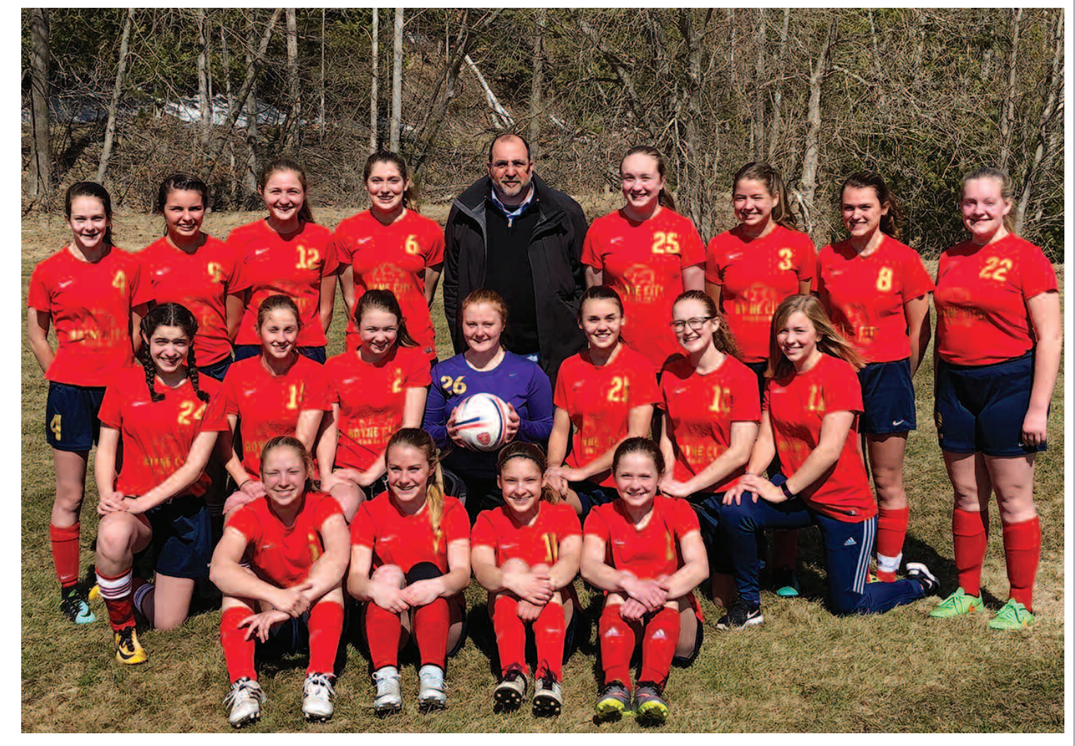
The Boyne City girls soccer team photo. The Ramblers improved to 4-0 on the season, by beating Lake Michigan Conference foes, Harbor Springs, TC St. Francis and Charlevoix, all for the first time in program history.