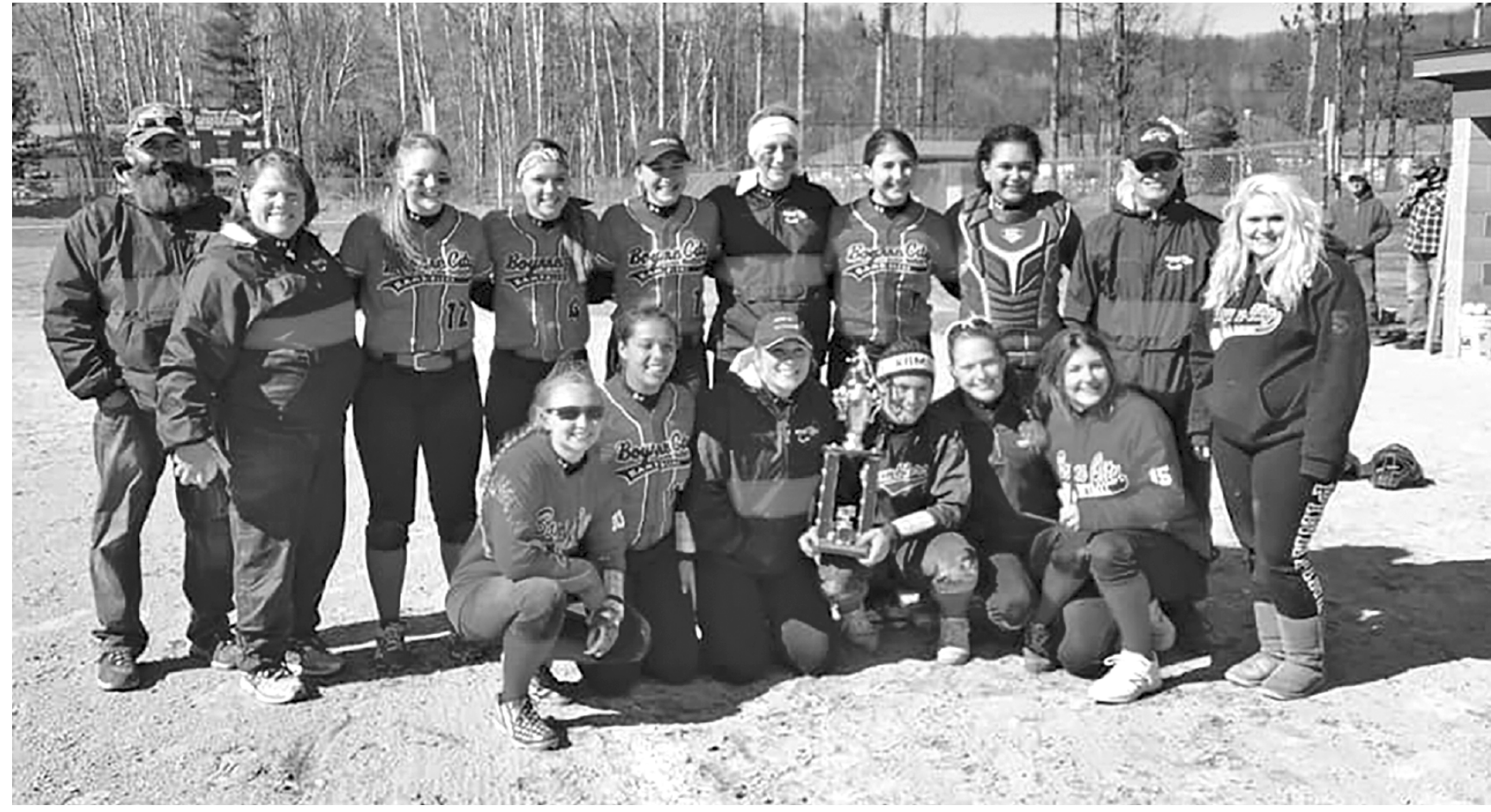
The Boyne City softball team and staff pose with the tournament championship trophy.

going, picking up in the third inning, where the team scored seven times and added five more runs in the fourth inning.